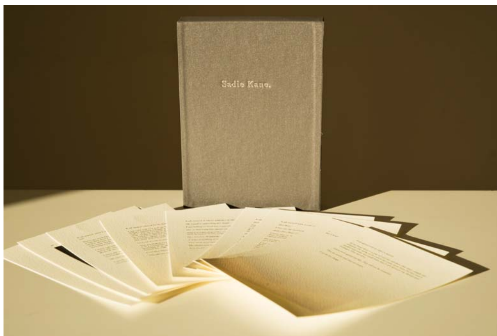
Sadie Kane , Set of 10 prints, boxed, 2013, Edition of 20, £125

Sadie Kane is a new work drawing directly from Forrest's moving image practice that was produced in response to the CCA's invitation to create an edition. The ten prints in Sadie Kane introduce ten moments, each of which appear to be the first moment in an uncertain chain of events. Collectively the prints present a narrative that is glimpsed without revealing itself entirely.