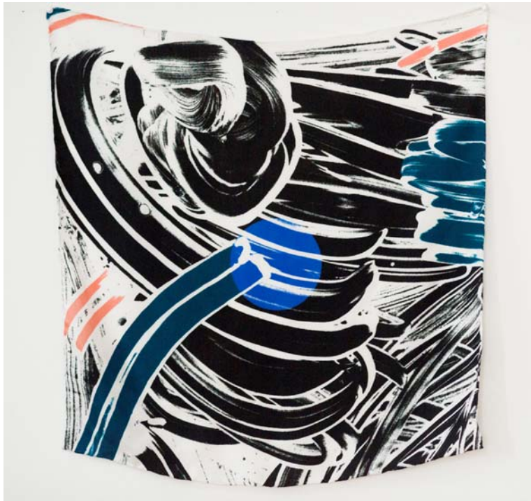
Scarf , Digital print on silk twill, 68 x 68cm, 2013, Edition of 30, £125

Glasgow-based artist Ciara Phillips has produced a limited edition silk scarf depicting a detail from a recent series of screen prints entitled The Century . Made by Phillips for And more , a solo exhibition at Inverleith House in May-June 2013, The Century is a collection of 100 unique screen prints inspired by printing processes developed by 18th century physician and botanist Johann Hieronymous Kniphof in Botanica in Originali, seu Herbarium Vivum (1754-64) and refers to Kniphof's production of prints in groups of 100 called 'centuries'.