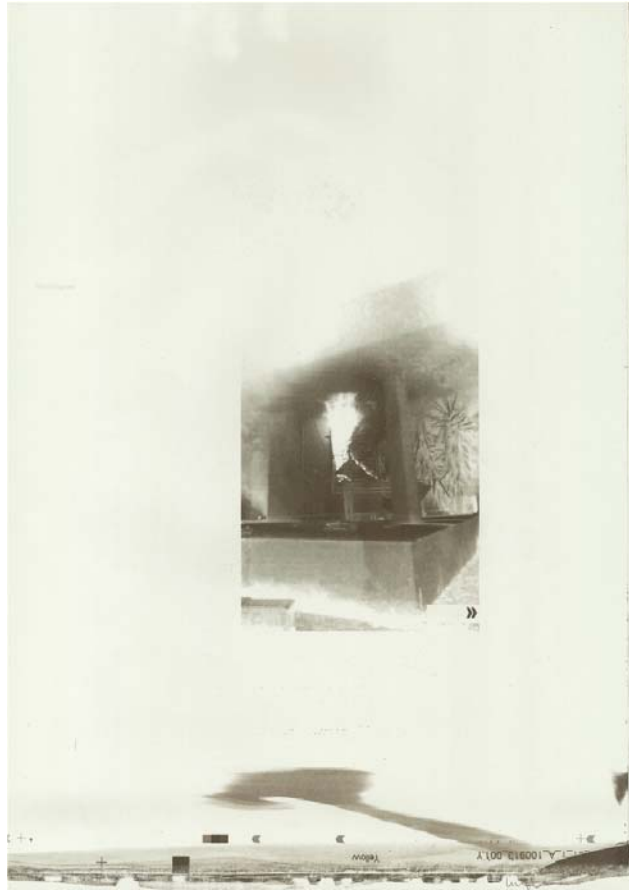
10.09.2013, Lithographic print made from Guardian newspaper plate, 2013, Edition of 20, £350 (unframed)